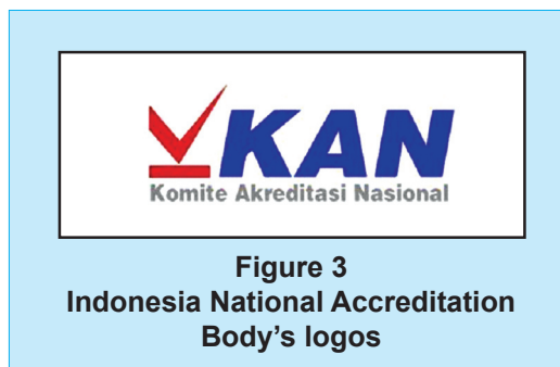
Figure 3 Indonesia National Accreditation Body's logos

In brief, this regulation states that in order a laboratory achieves acknowledgment as an environmental laboratory, the laboratory has to possess identity of registration issued by the Minister of Environment (Article 4, point 1b). Before the laboratory can apply for the registration, however, the laboratory has to possess a certificate of accreditation issued by an authorized accreditation agency (Article 4, point 1a). The authorized accreditation agency in Indonesia is National Accreditation Body of Indonesia. (KAN, Komite Akreditasi Nasional ; see Figure 3).