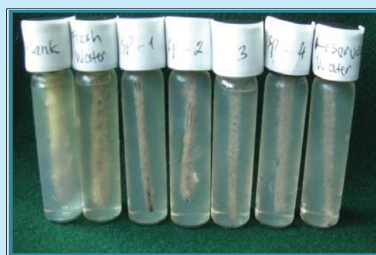
Figure 1 Sulfate Reducing bacteria observation.

Based on SRB observation (Figure 1) shows that a small number of bacterial cells to the outlet Gathering Station classified generally insignificant contamination. In microbiology addition of biocide with the correct type and optimal concentration which can effectively reduce the bacterial cells that live in the water injection. Zulkifliani and Usman (2011) reported that the general aerobic bacteria population in water injection is more dominant than the SRB. This condition can occur because the surface facilities and allows the cells of general aerobic bacteria group can grow better than groups of anaerobic bacteria.